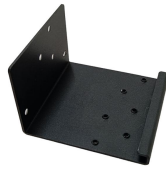
A02 Side DIN rail mounted kits