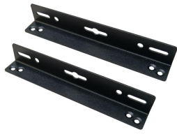
TK12 Wall-mounted kits