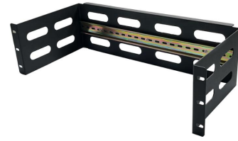
CK01 Rack-mounted bracket